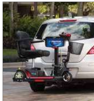
Multiple auto lift solutions for chair or scooter