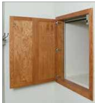
Dumbwaiters and Cargo Lifts