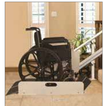
Incline Platform Lifts