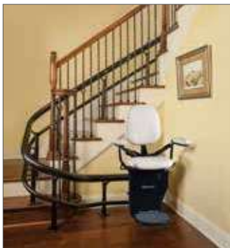
Curved and Straight Stair Lifts